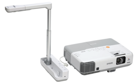
Share 3D objects using the ELP-DC06 document camera